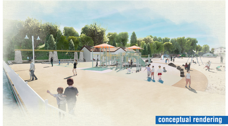
New playground equipment with shade structures and spray features is under consideration.