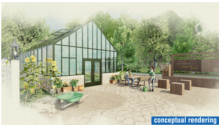
Illustration of new greenhouse at Shelton Park.