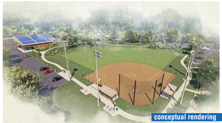
Preliminary ideas for updated North Field and new Park Maintenance Facility.