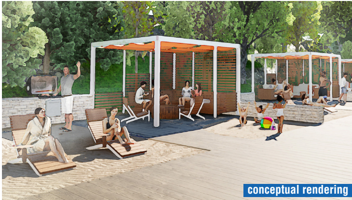
Potential improvements include boardwalk updates and new sun shelters.